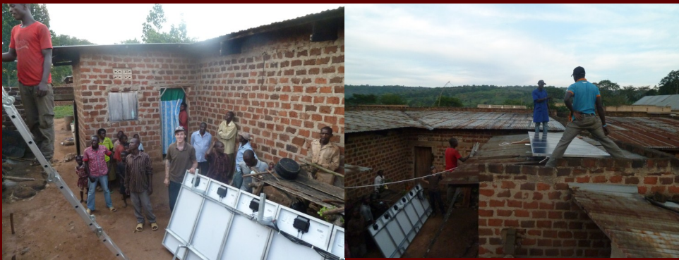
Above: Installation process of the solar PV panels on the rooftops of some of the homes that are benefitting from the mini grid.