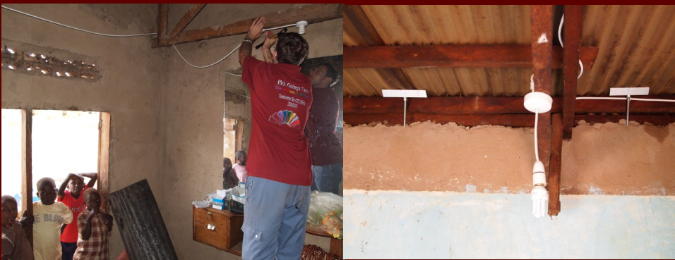
Above: Connection and wiring process inside the houses for solar PV power access.

A solar PV mini grid system was installed at Nakasengere village in Kiboga District to supply lighting power to people. The installation was done on 18 th December 2012 and now supplies five homes. The system faced a challenge of overconsumption before the end of 2012. CREEC's solar PV team re-instated a charge controller to solve the issue of overconsumption of energy from the system.